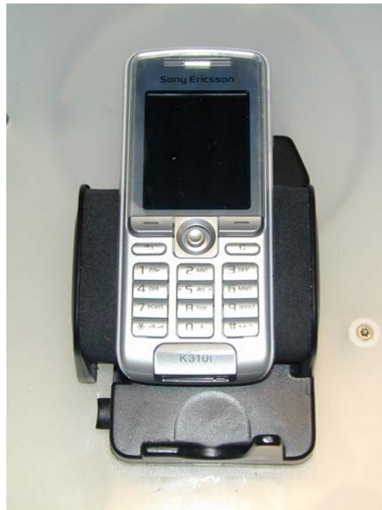
Rohde & Schwarz Shield Box and Coupler